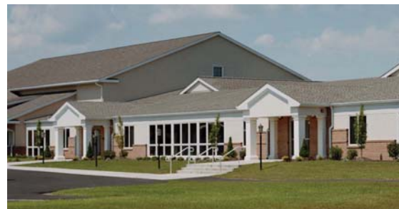
Calvary Bible Fellowship, Sinking Spring, PA

Discover the financial strategies open to church congregations and how those options work to fulfill the unique needs of your church's vision.