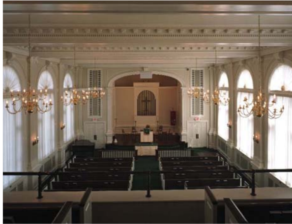
Evangelical Theological Seminary, Myerstown, PA

BULK MAIL US POSTAGE PAID QUARRYVILLE, PA PERMIT NO. 211